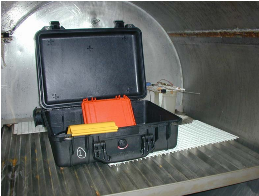
Photograph 4-1: Test units in the chamber prior to inoculation