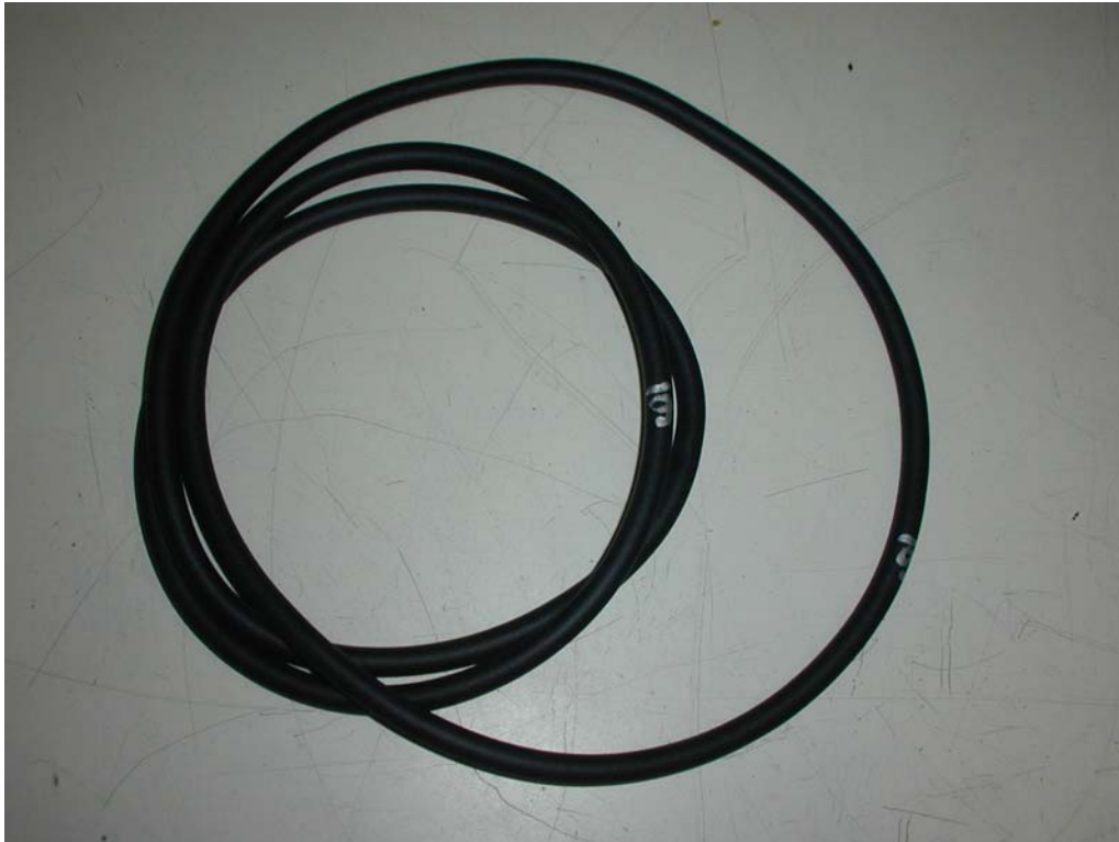
Photograph 4-7: Gasket upon completion of the incubation period